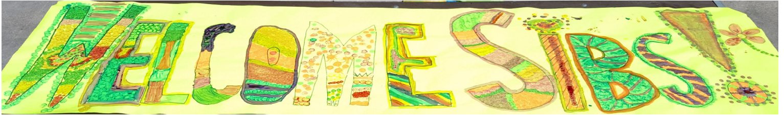
Sign created by the Small Shelter Group at SibDays